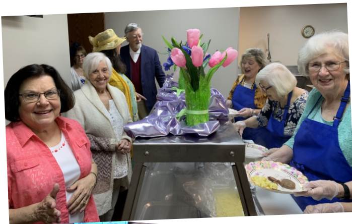
Below: Easter breakfast in the sanctuary.